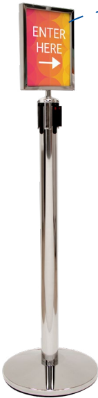
Chrome Sign Holder shown with Deluxe Belt Barrier (sold separately)

Production Lead Time: 2 days from final proof approval