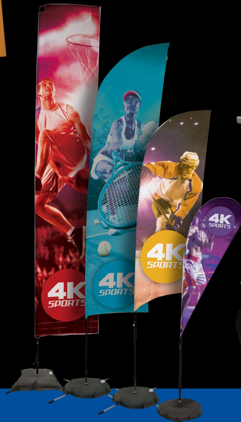
Streamline Sail Sign