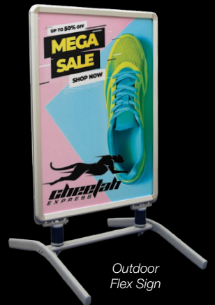
Outdoor Flex Sign