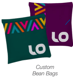
Custom Bean Bags

Production Lead Time: 6 days from final proof approval Hardware Lead Time: Ships same day when ordered before 2 p.m. Central