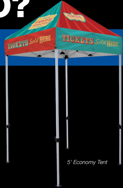
5' Economy Tent