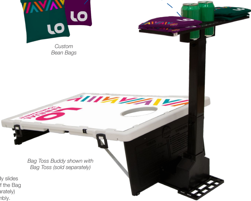
Bag Toss Buddy shown with Bag Toss (sold separately)