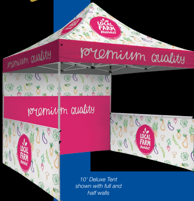
10' Deluxe Tent shown with full and half walls